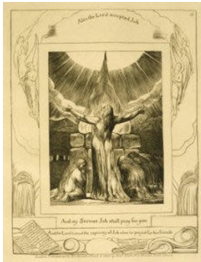
Blake's Illustrations of the Book of Job , Plate 18