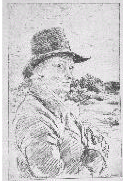
William Blake from a drawing by John Linnell, 1821

Even Blake's early years were hardly normal. Born in 1757 in Soho, London, the third of seven children of a moderately successful merchant, Blake,