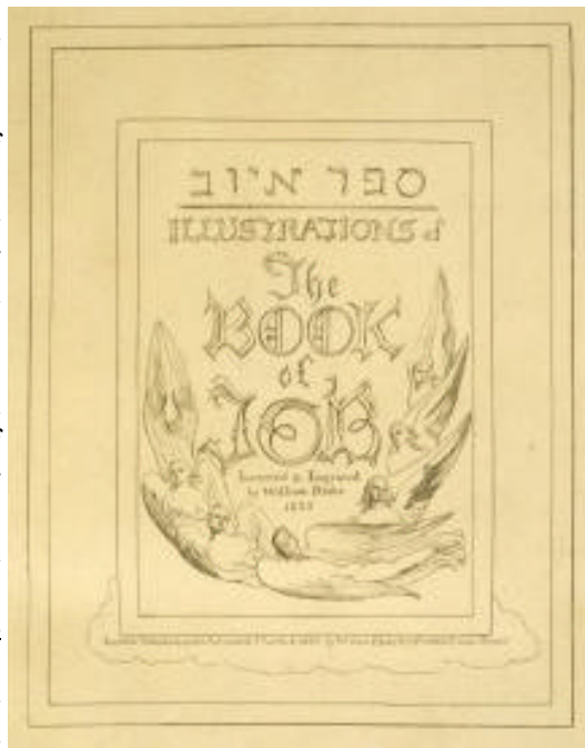
Title Page of Illustrations of the Book of Job

Between these two milestones of early Romantic verse, Blake wrote The Book of Thel (1789), the first of a series of increasingly mythical religious texts which came to be known as the "prophetic books" (a term that broadly could be applied to all of Blake's work) and The Marriage of Heaven and Hell (1793), which also explored the question of faith and the relationship of God and man. Blake followed these with even more complex and more mystical views of his mythological/historical universe: Visions of the Daughters of Albion (1793), The First Book of Urizen (1794), The Book of Los (1794), The Book of Ahania (1795), and The Four Zoas (1807).