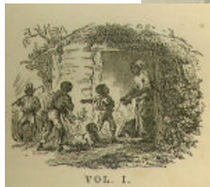
Illustration from Uncle Tom's Cabin