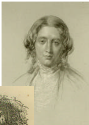
Harriet Beecher Stowe

Included in the exhibit are major works which relate directly or indirectly to the involvement of women in abolitionist activities in the several decades before the Civil War. From the first major literary work by a black author, Phillis Wheatley's Poems on Various Subjects, Religious and Moral (1773) to Harriet Beecher Stowe's monumental Uncle Tom's Cabin (1852) to Harriet Jacobs' Incidents in the Life of a Slave Girl (1861), the exhibit highlights the writings of vocal and influential women authors and activists, including Lydia Maria Childs, Harriet Martineau, Catherine Maria Sedgwick, Lucretia Mott, and Sojourner Truth, and emphasizes that women individually and collectively were in the forefront of abolitionist activities.