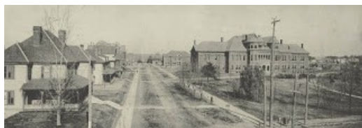
View of campus along College Avenue, 1905

Welcome to Spartan Stories ! Here, staff of the University Archives at The University of North Carolina at Greensboro will share tales from the long history of our institution. From its founding in 1891 as a publicly-funded school for women's higher education to its current standing as a learner-centered public research university, UNCG has a unique history filled with interesting stories. On this blog, we look to share these stories with students, faculty, staff, alumni, and others who wish to learn more about how our university became - and, in many ways, has always been - a source of innovation and leadership within North Carolina and beyond. Join us every Monday morning (beginning October 1, 2012) as we tell a new Spartan Story. You can subscribe to the blog via RSS feed or email using the options on the right side of the screen. And please feel free to share links to the site with anyone you feel would be interested. We hope you will enjoy our glimpses from the past as much as we enjoy sharing them! See http://uncghistory.blogspot.com/