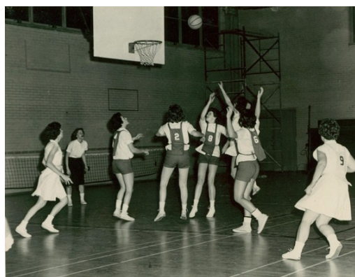
Woman's College versus Guilford College, 1963

Just in time for March Madness, the Martha Blakeney Hodges Special Collections and University Archives presents "Spartan