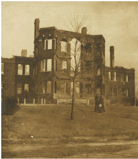
Brick Dormitory after the fire, 1904

The Martha Blakeney Hodges Special Collections and University Archives invites students, faculty, and researchers to learn more about the various tragic events that occurred on the campus of The State Normal and Industrial School (now UNCG) from its opening in 1892 to 1932 by viewing the recently installed exhibit "Tragedies on Campus: The Early Years, 1892-1932." Using archival documents and photographs, the exhibit explores the fires in the Brick Dormitory, the Carnegie Library, and in the